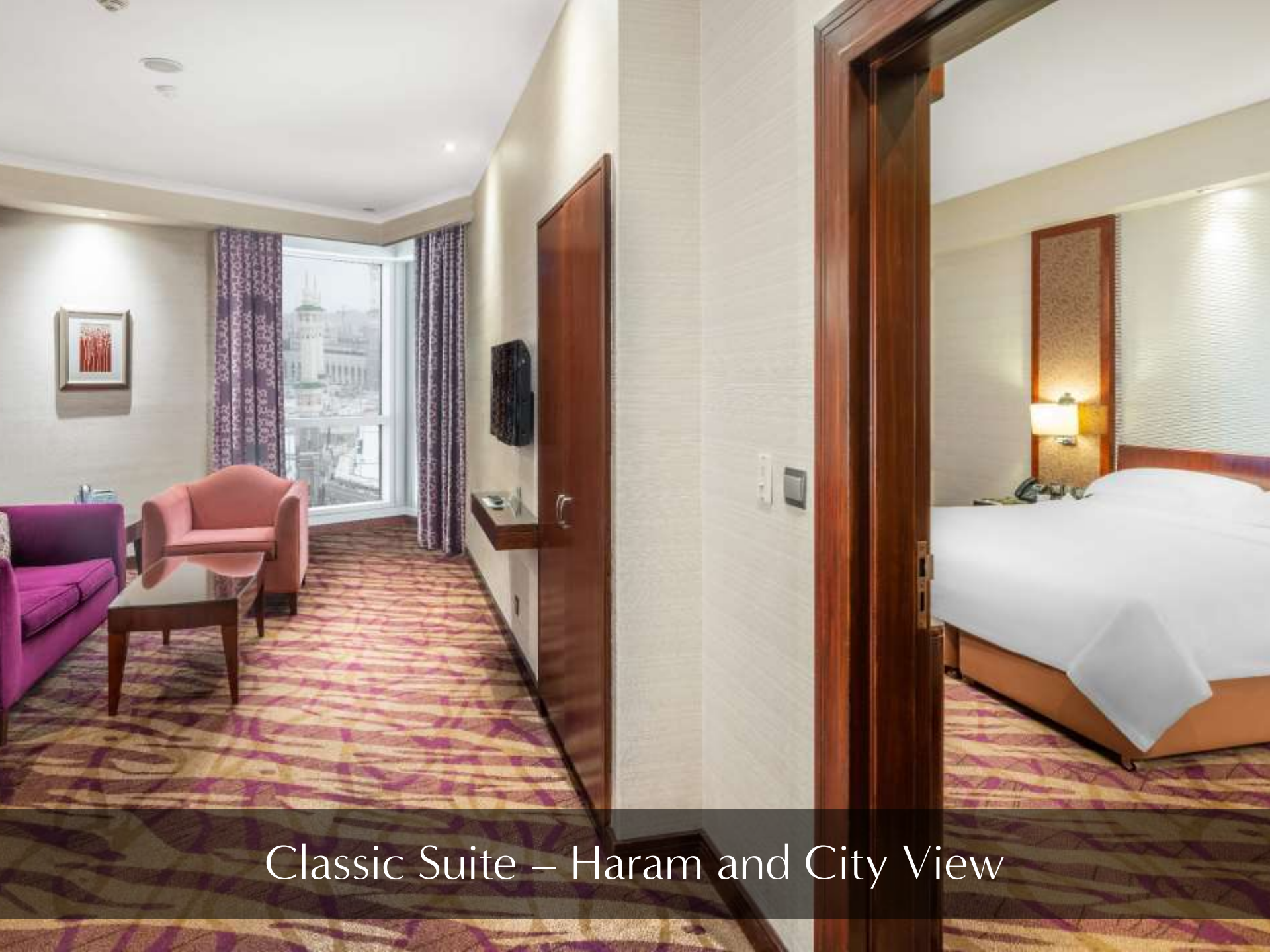
Classic Suite – Haram and City View