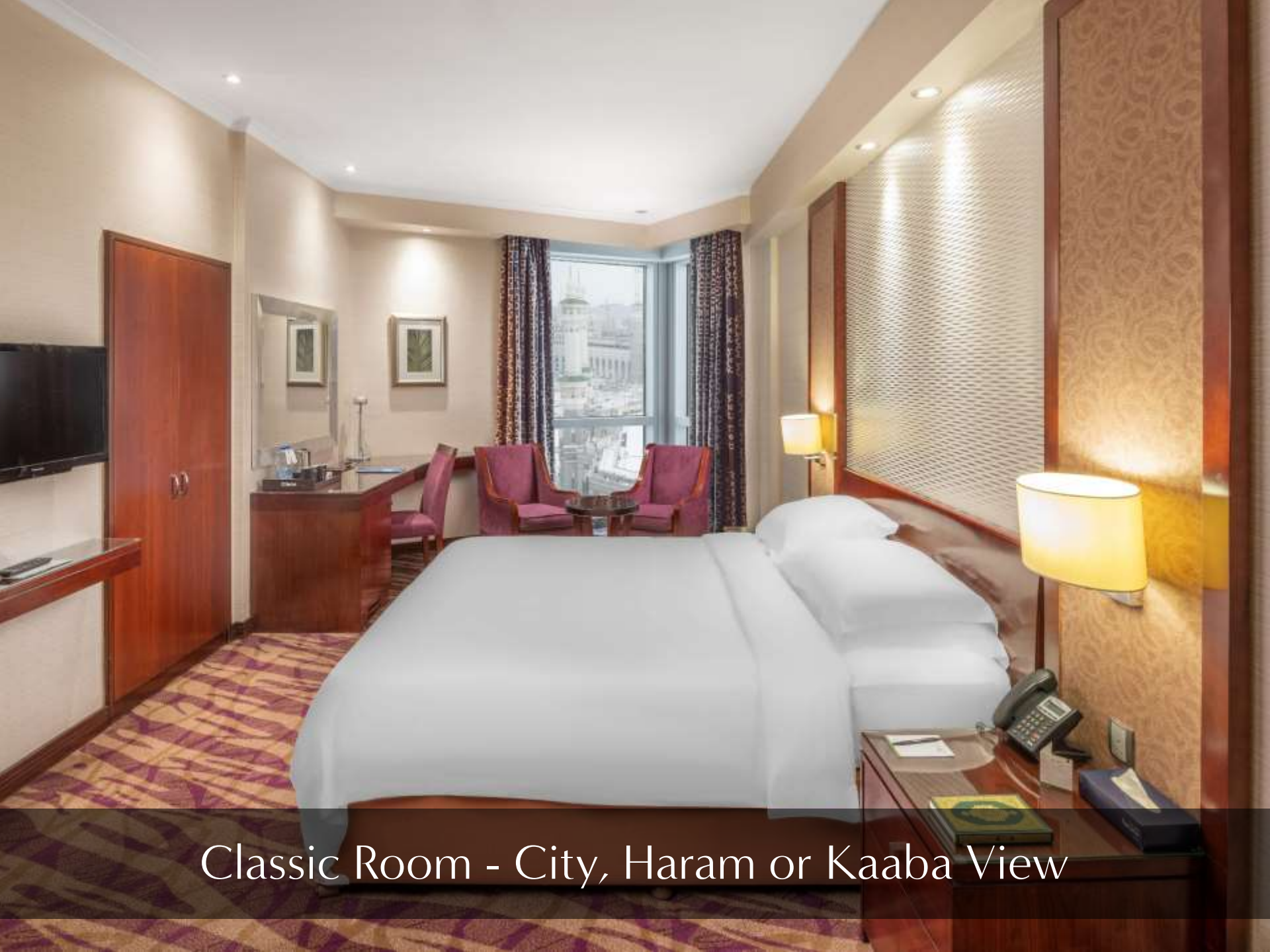
Classic Room - City, Haram or Kaaba View