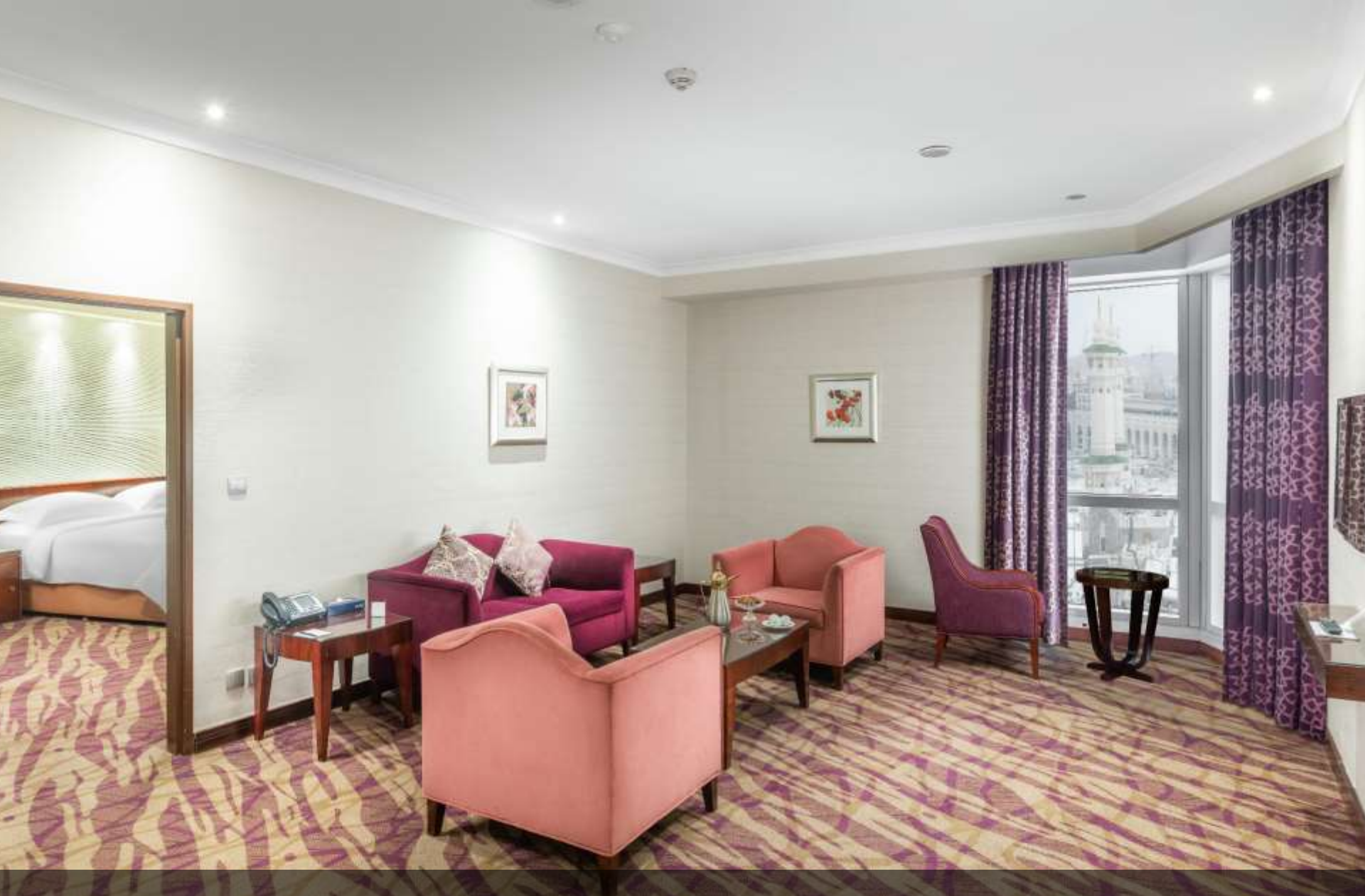
Deluxe Suite – Part Haram and City View