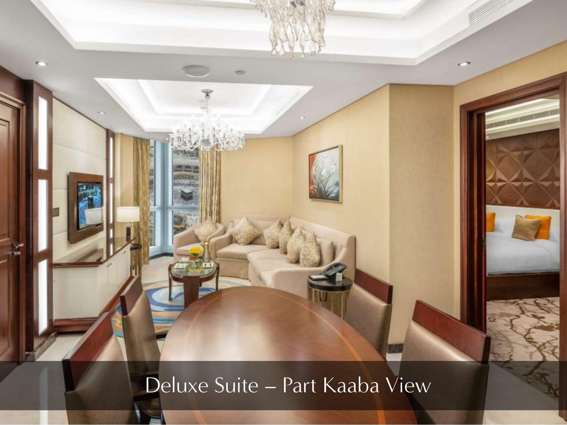
Deluxe Suite – Part Kaaba View