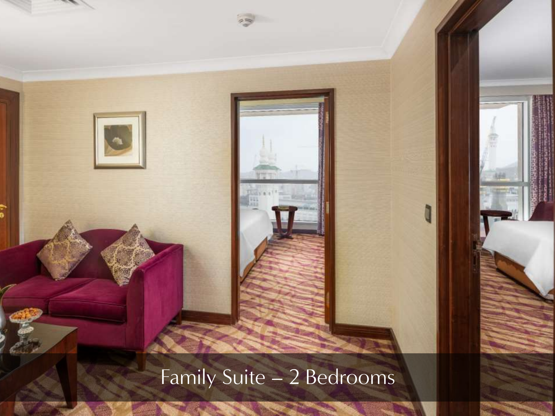
Family Suite – 2 Bedrooms