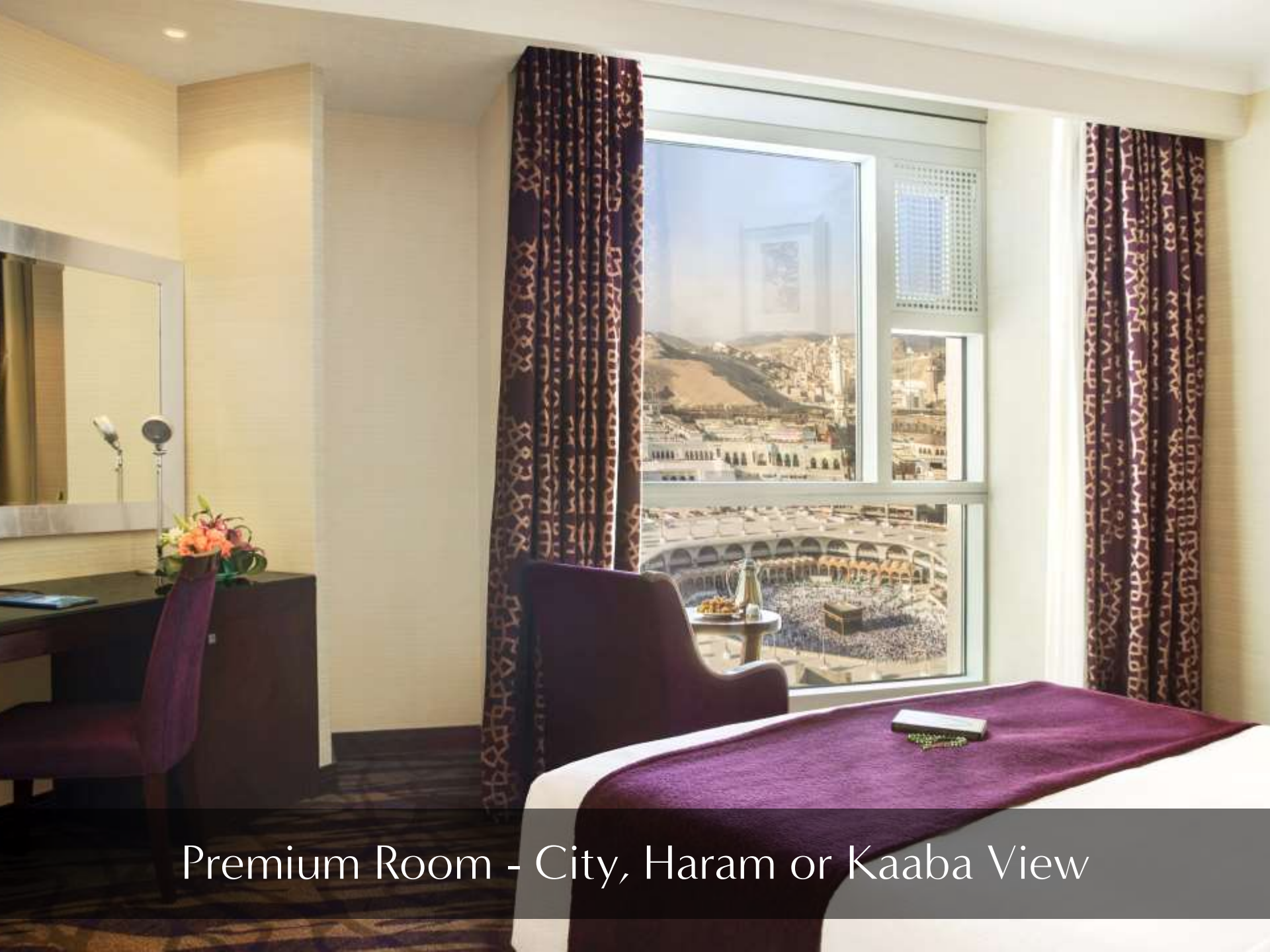
Premium Room - City, Haram or Kaaba View